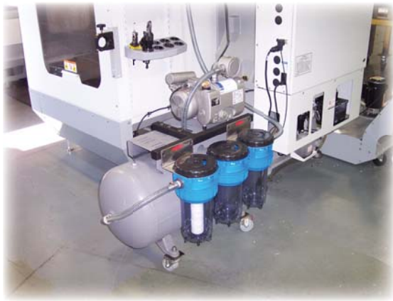
This completely portable unit features a 3 stage coolant filter.